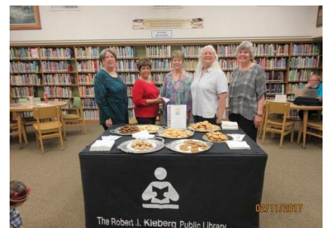
Friends of the Kleberg Public Library